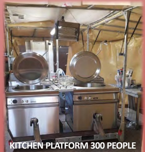
KITCHEN PLATFORM 300 PEOPLE