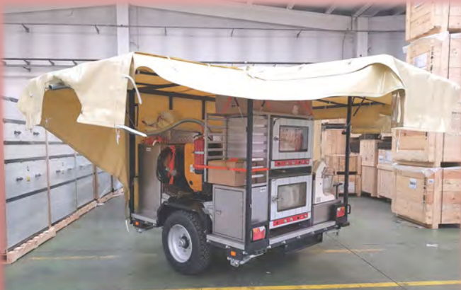
BAKERY TRAILER 110 PEOPLE