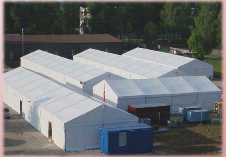
RENTAL OF CIVIL AND MILITARY CAMPS