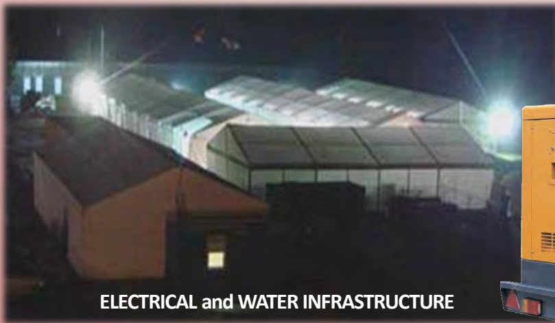
ELECTRICAL and WATER INFRASTRUCTURE

During the deployment of military forces, the supply of electricity and water is essential. MANDRADE CONSULTS proposes total or partial infrastructure solutions depending on the client's needs and mainly composed of generators, primary and secondary panels, adapted wiring, internal and external lighting, pumps, foldable tanks, hoses, etc. In it we include development and design of electrical and water plans adapted to the camp or hospital.