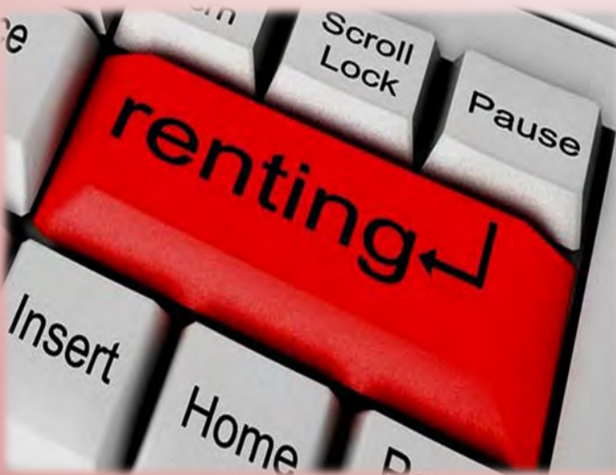
PROFITABLE AND DIVERSE RENTAL PROPOSALS