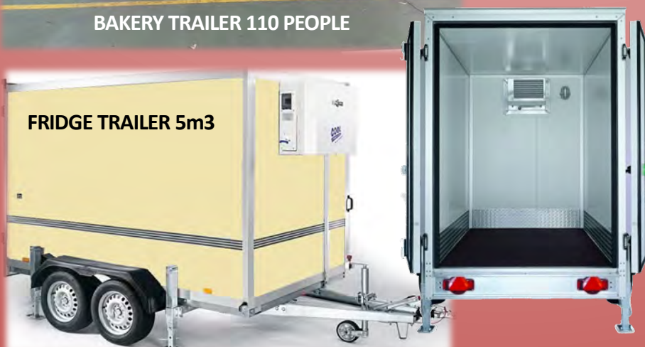
FRIDGE TRAILER 5m3