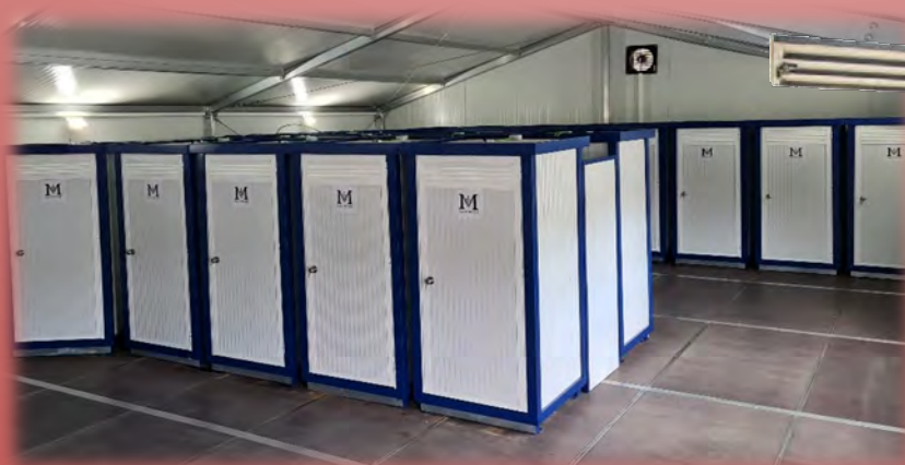
INDIVIDUAL WC MODULES

During the deployment of the military forces, there are different sanitary solutions that are perfectly adapted to the needs of our clients. From individual WC modules and SHOWERS, showers, WC or mixed containers, portable sinks and flexible water tanks of different capacities to store clean, gray or black water, as well as water treatment plant trailers.