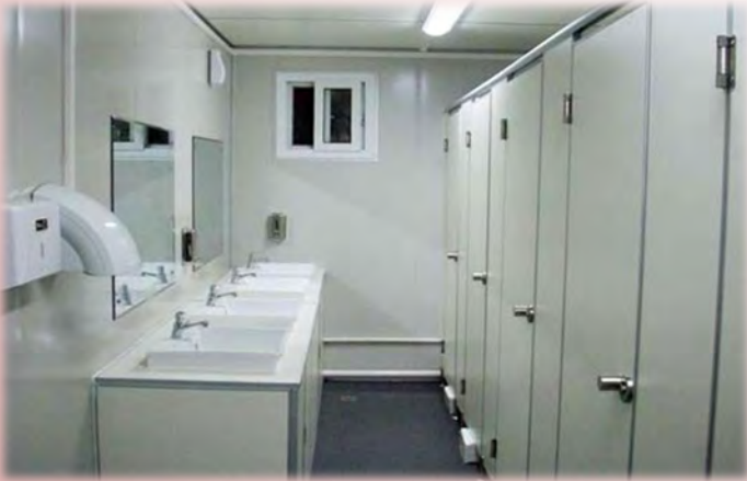
WC and SHOWERS in CONTAINERS