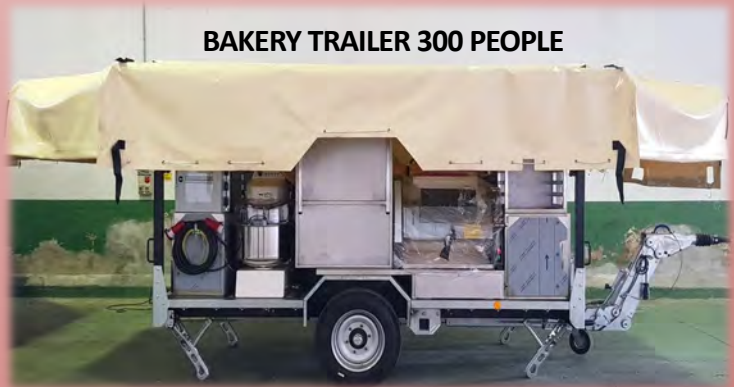
BAKERY TRAILER 300 PEOPLE