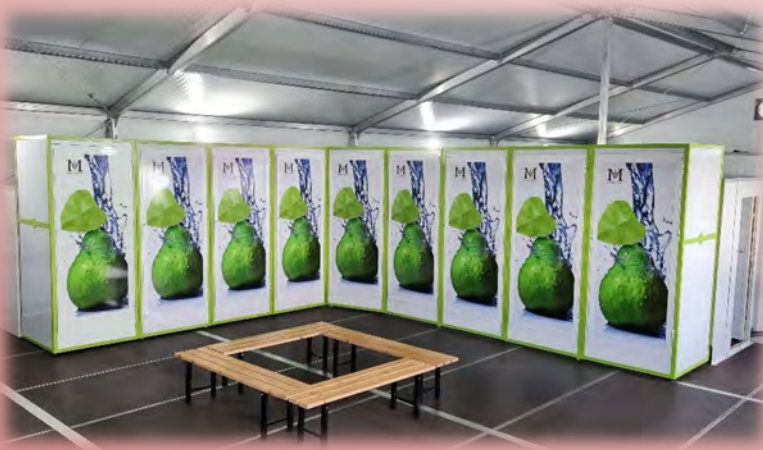
INDIVIDUAL SHOWER MODULES