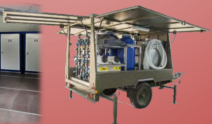
WATER TREATMENT PLANT ON TRAILER