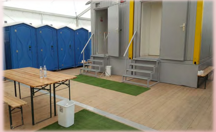
WC MODULES and SHOWER CONTAINERS